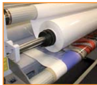
MOTORISED TAKE UP UNIT*