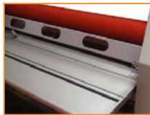
LARGE SWING OUT FEED TRAY