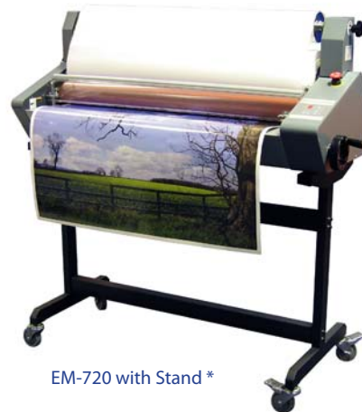
EM-720 with Stand *