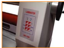
USER FRIENDLY CONTROL PANEL