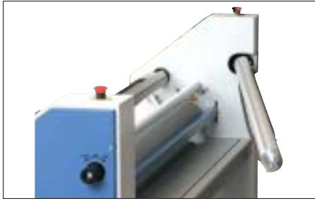
Swing out supply shafts for easy loading.