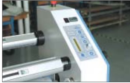
Ergonomic control panel for ease of use.