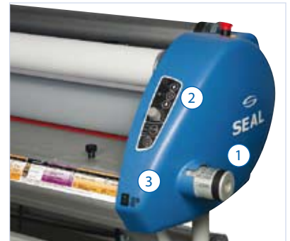
Roll capture mechanism on the 62 Ultra Plus.