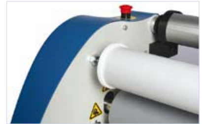
Powered upper rewind station.

SEAL® is a registered trademark of SEAL Graphics