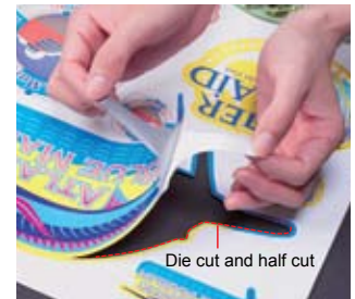
The half cut function is Mimaki's proprietary technology