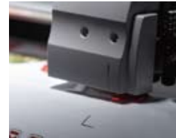
A light pointer easily adjusts the head position to the crop marks.

An optical sensor enables automatic consecutive detection of crop marks throughout the nested images. Together with the automatic adjustment function, it helps to achieve precise contour cutting.