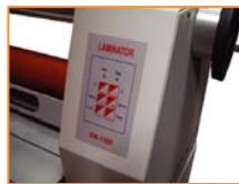
USER FRIENDLY CONTROL PANEL