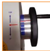
ROLLER PRESSURE GAUGE