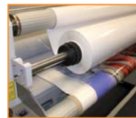
MOTORISED TAKE UP UNIT*